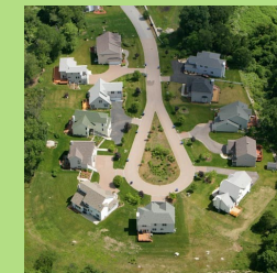
Bioretention area in Waterford, CT (middle)

Bioretention areas are similar to rain gardens, but are much larger in size and are engineered to perform a wider