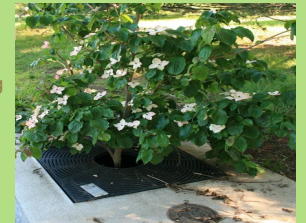
Tree box filter in East Lyme, CT

Tree box filters function similarly to rain gardens; they are placed on or near roads, sidewalks, or parking lots to absorb stormwater runoff. The engineered soil medium helps to improve water quality by removing common pollutants from stormwater before it is absorbed into the soil surrounding the filter. If an intense precipitation event occurs, there is an outflow pipe within the tree box filter that discharges excess water to the town's storm drain system.