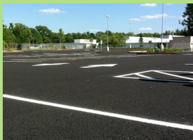
Pervious asphalt at Goodwin College

are used to de-ice the roads; fine particles can end up in the void spaces and reduce the asphalt's ability to absorb water.