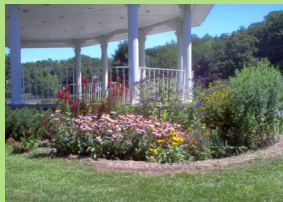
Rain garden in Niantic, CT

Rain gardens are similar to green roofs in that they use soil and vegetation to absorb excess stormwater. However, since rain gardens aren't limited to a rooftop location, they can support a greater variety of vegetation. Though they aren't found on roofs,