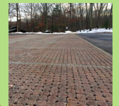
Pavers in Tolland, CT

Pavers come in many different shapes and sizes, but they all function in the same way. While conventional pavement does not allow water to infiltrate, spaces are built into pavers which allows water to be absorbed into the soil, reducing the volume of runoff that comes off of sidewalks, roads, and parking lots. The pavers can be constructed with concrete, brick, stone, plastic, and even recycled glass depending on the volume of traffic expected.