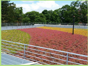
Green roof at the University of Connecticut

Green roofs are roofs that are host to a garden of low-maintenance vegetation. A layer of waterproof material separates the actual roof from the garden to prevent leaking of rainwater. The vegetation is drought-resistant and able to withstand the extreme heat