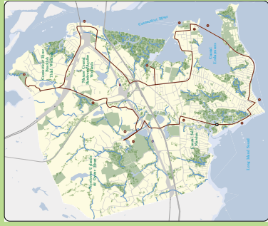
Tour map on other side