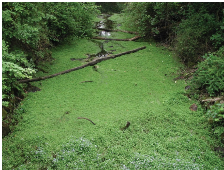
An extremely dense invasion of pond water-starwort ( Callitriche stagnalis ).

Remember, each situation is unique; this document is intended only as a basic guide.