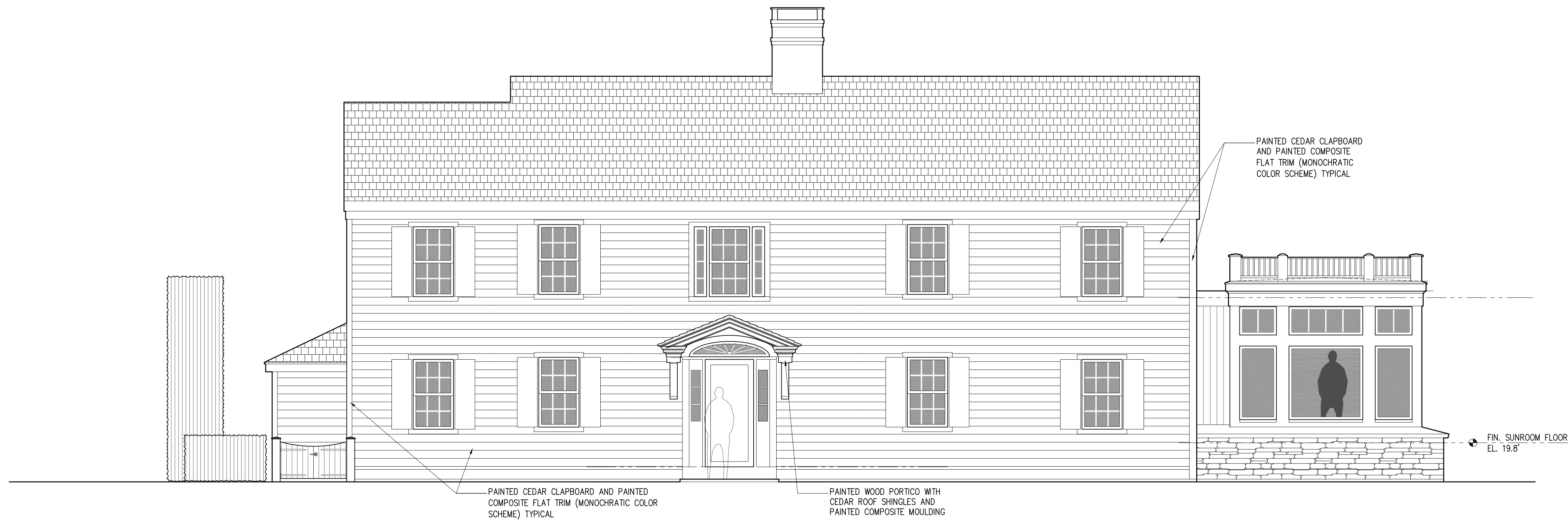
1 BUILDING ELEVATION (SOUTH) SCALE: 1/4"=1'-0"