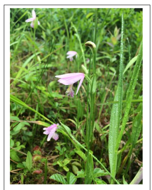
Figure 32. Rose Pogonia in Medium Fen "Sand Bog" occurrence on glaciofluvial sandy soil in Eversource ROW. This is a northern-affinity, circumboreal.