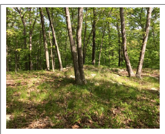
Figure 19. Summit expression of Dry Subacidic Forest type, Ash/Hickory Glade sub-type

Anemone quinquefolia Antennaria plantaginifolia Aquilegia canadensis Asclepias quadrifolia Asplenium platyneuron Boechera canadensis Aureolaria virginica Bromus pubescens Cardamine parviflora Carex digitalis Carex retroflexa Cinna arundinacea Desmodium rotundifolium Dichanthelium boscii Dichanthelium latifolium Eupatorium sessilifolium Festuca subverticillata Geranium carolinianum Hedeoma pulegioides Lespedeza frutescens Lespedeza procumbens Muhlenbergia tenuiflora Paronychia canadensis Ranunculus abortivus Scrophularia lanceolata Silene antirrhina Solidago ulmifolia Sphenopholis intermedia Sphenopholis nitida Symphyotrichum undulatum Teucrium canadense Thalictrum revolutum Trichophorum planifolium Triodanis perfoliata Triosteum aurantiacum Viola palmata Viola subsinuata