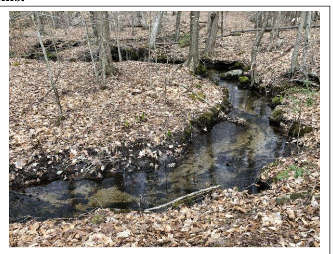
Figure 18. Headwater stream downstream of extensive Seepage Swamp complex, in late March 2020. This stream still had surface water, as intermittent pools, during the late summer drought.

This Critical Habitat is not among those mapped for the 2009 CT-DEP "Critical Habitats" GIS coverage, but Cold Water Streams were identified in the 2005 CWCS and 2015 WAP as a "sub-habitat" determined to be important to [GCN] wildlife. I mapped approximately 3.5 of the headwater streams in The Preserve as Cold and/or Cool Water streams, based on their being nearly 100 percent under closed canopy forest, the evident abundant input of spring seepage maintaining the stream flows. some late summer stream