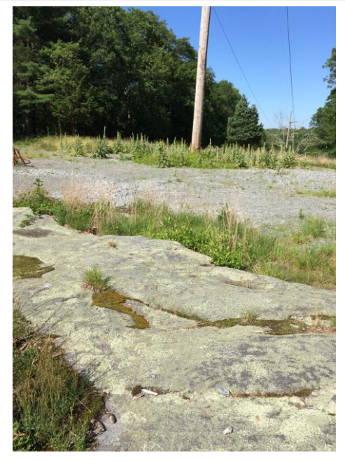
Figure 14. Acidic Rocky Summit Outcrop (Grassy Glade/Bald Sub-type) in Eversource ROW.

This habitat is similar in the open-canopy structure, landscape position, and a portion of its floristic composition to Subacidic Rocky Summit Outcrop. The two habitats differ in