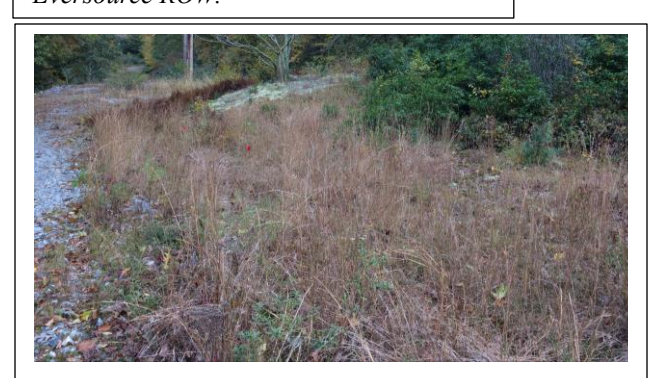
Figure 16. Example of Acidic Rocky Summit Outcrop (Grassy Glade/Bald Sub-type) in ROW with less bare rock and more soil and herbaceous cover.