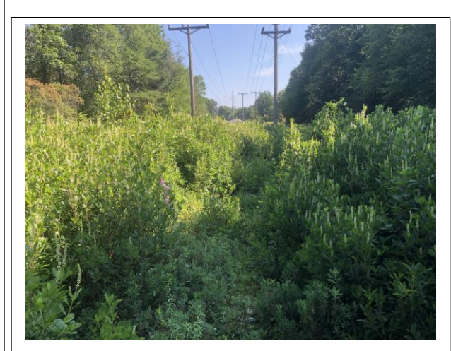
Figure 38. Same habitat in July 2020, growing up into shrubland.

where this community fits into the 2015 WAP classification. It could be put in the Key Habitat Upland Herbaceous or into Unique; Natural or Man-made. I have mapped this community as significant because it hosts 3 PCC plants and several uncommon habitat-restricted plants. In this community, the rare and uncommon species are concentrated in the ROW service road, while the less frequently disturbed areas outside the service road have become dominated by low heaths and Sweet Pepperbush ( Clethra alnifolia ), and there is a deeper surficial layer of organic material (i.e., duff) than in the service road habitat. At present, it appears that the woody shrubs are gradually invading the service