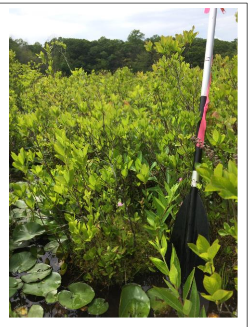
Figure 30. Medium Fen, Other/Unique sub-type with Sweet Pepperbush a dominant sub-shrub. This part of the fen is also buoyant but with well-developed hummock-and-hollow microtopography.