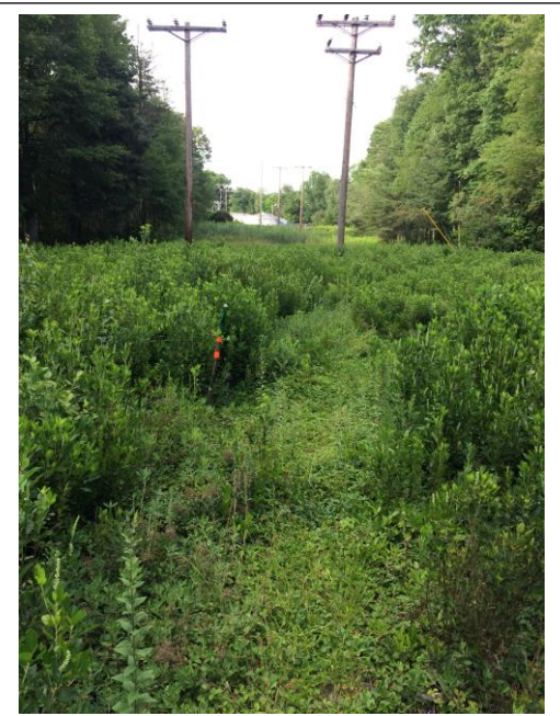
Figure 37 Moderately Well-drained Acidic Sandy Grass-/heath-land (Other/Unique), in July 2018. Shrubs barely 3 ft high.

This community also occurs in the in the portion of the Eversource power transmission ROW that traverses glaciofluvial sand deposits, at a slightly higher elevation than the above-described Wet Meadow community. The soil hydrologic regime in this community is moderately well drained or somewhat poorly drained, with a seasonally high water table. This community is maintained by ROW vegetation management. It is not clear