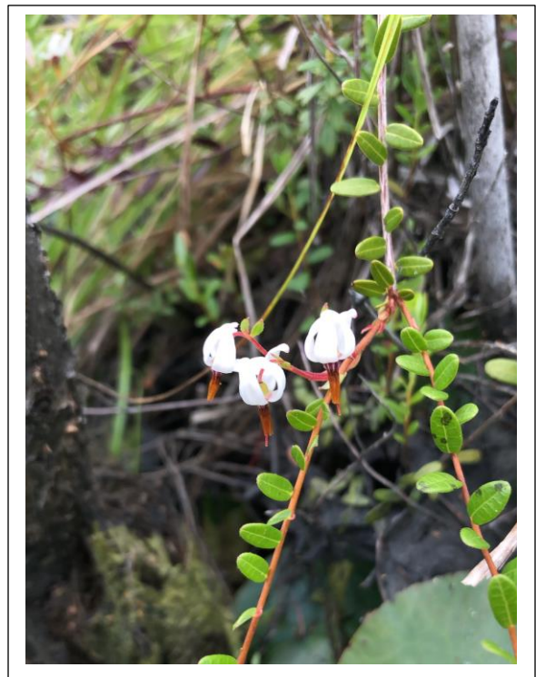
Figure 29. Large Cranberry in flower in late June.

PCC plant (Species H) that occurs in these two subtypes, and it is unique at The Preserve to the Pequot Swamp Pond fens. The Sedge Fen is the most bog-like in appearance, being a continuous