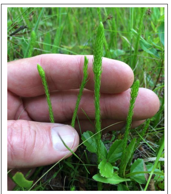
Figure 33. Southern Bog-clubmoss in Medium Fen "Sand Bog" occurrence on glaciofluvial sandy soil in Eversource ROW, growing next to Rose Pogonia.