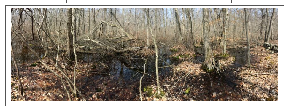
Figure 27. A "cryptic" Vernal Pool, Klemens' #10, a "High Priority" pool, in late March, 2019.

pool facultative species such as spotted turtles and four-toed salamanders and/or State-listed Special Concern species such as ribbon snake, box turtle, and spotted turtle. Using these criteria, Klemens classified at least 13 of The Preserve's vernal pools as High Priority in his 2004 report, and 1-4 more in his 2005 report. Klemens found no State-listed amphibians at The Preserve. However, he considered the abundance of the marbled salamander, the less common of the 2 obligate vernal pool salamanders that are not State-