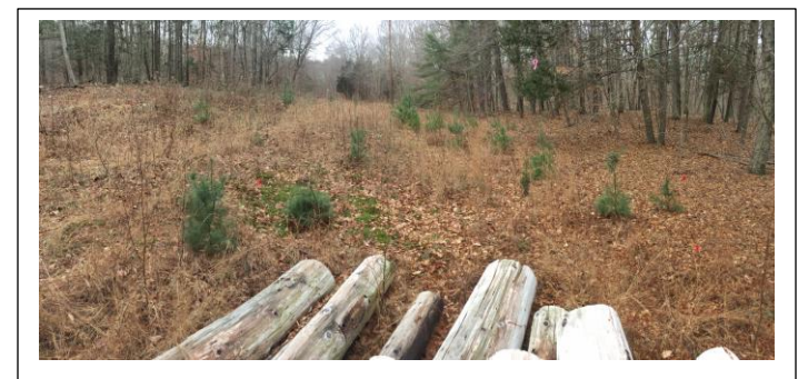
Figure 40. Dry Warm Season Grassland in Eversource ROW, late fall aspect.

for the same species. These communities are dominated by the native warm season grasses Little Bluestem ( Schizachyrium scoparium ) and Virginia Bluestem ( Andropogon virginicus ). And they are very similar to, and perhaps could be considered a form of, Acid Rocky Summit Outcrop- Grassy Glade/Bald, but I have made it a separate entity because it is relatively