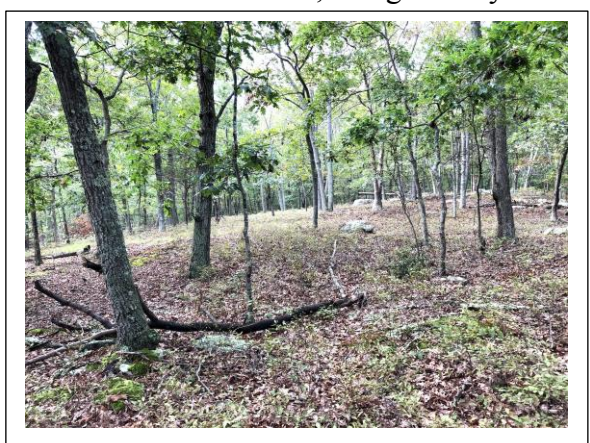
Figure 39. Dry Acidic Forest, Oak Woodland Sub-type.

In the 2015 WAP, this community is classified under the Oak Forests sub-habitat of the Key Habitat Upland Forest. In the 2006 Metzler & Barrett natural community classification, these are Dry Acidic Forests on Glacial Till, and the two vegetation subassociations Black oak - Chestnut oak / Black huckleberry ( Quercus velutina - Quercus prinus / Gaylussacia baccata ) community and Black oak / Blue Ridge blueberry ( Quercus velutina / Vaccinium pallidum ) community. These subassociations are very common in Connecticut and at The Preserve, and generally do not have PCC and