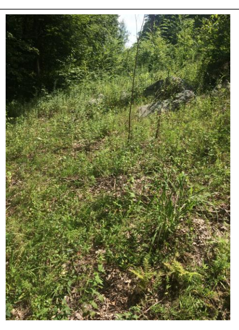
Figure 24. Subacidic Rocky Summit/Outcrop, Other/Unique subtype, in the power transmission ROW. This expression occurs low on the northfacing slope, where there is relatively more sun exposure, and Haircap moss is not important as a ground cover.

occurring frequently at interval along 1.8 mile of the ROW, cumulatively occupying 5.27 acres. Some of these occurrences are on landscape positions similar to those where Subacidic Rocky Summit Outcrop occurs outside of the ROW, i.e., rocky convex summits of knolls and ridges, south-facing brows and upper slopes. Based on my examination of 1934 aerial photography, it appears these sites may have supported Subacidic Rocky Summit Outcrop Cedar Woodland communities<sup>43</sup>. In any case, the