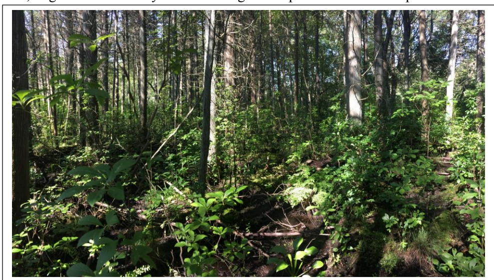
Figure 28. Atlantic White Cedar Swamp, in glaciofluvial outwash soils portion of The Preserve.

Several mature AWC trees occur in a small group just east of the Eversource ROW, which appears to have cut though part of the original ~20-acre stand. This small stand was not, in my opinion, large and floristically distinct enough to map as an AWC Swamp.