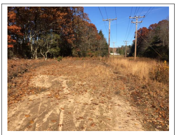
Figure 34. Sand Barren, Other/Unique sub-type in power transmission ROW.

dominated zones on either side, which illustrates the importance of a certain amount of disturbance to maintaining the plant diversity.