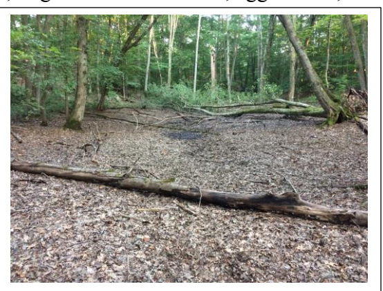
Figure 26. A "classic" Vernal Pool, Klemens #20, ranked a "High Priority" pool, in early September, 2019.

Klemens considered the majority of vernal pools at The Preserve to be "cryptic", which means the vernal pool is a part of a larger wetland system<sup>47</sup>, and a minority of them to be "classic" vernal pools, which are seasonally flooding depressions that are isolated from other wetlands. Klemens collected data on vernal pool obligate amphibian productivity, hydroperiod, water chemistry, May and late June water depths, and dimensions of vernal pools ca. mid-May. Klemens then ranked the biodiversity significance of each vernal pool, and I have carried over those rankings to my Preserve Critical Habitat attribute data. Klemens classified as "High Priority" vernal pools that had all 3 obligate vernal pool amphibians (wood frog, spotted salamander, and marbled salamander), had high obligate species productivity (i.e., large numbers of adults, egg masses, and larvae), had vernal