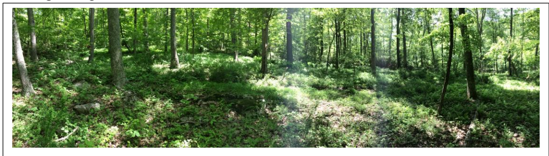
Figure 36. Acidic Seepage Forest, in late May.

Maple and often White Ash are dominant canopy trees in this community, but at The Preserve, Tuliptree ( Liriodendron tulipifera ) is most frequently the dominant canopy tree, and Sugar Maple and White Ash are local as dominant trees. I have some reason to