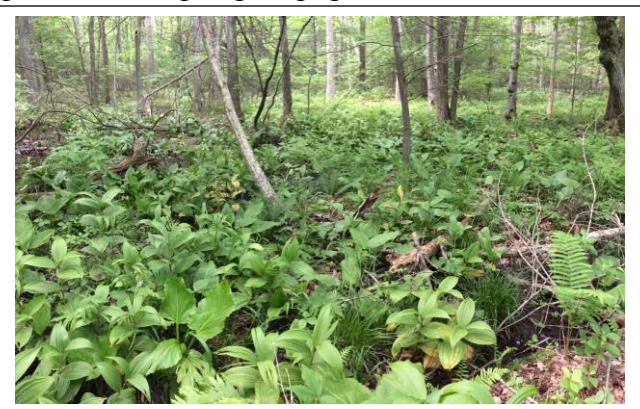
Figure 35. Headwater Seepage Swamp, June aspect.

are distinguished from basin swamps by occupying slopes that are kept wet by groundwater spring seepage, and because of this there is little build of organic sediments.