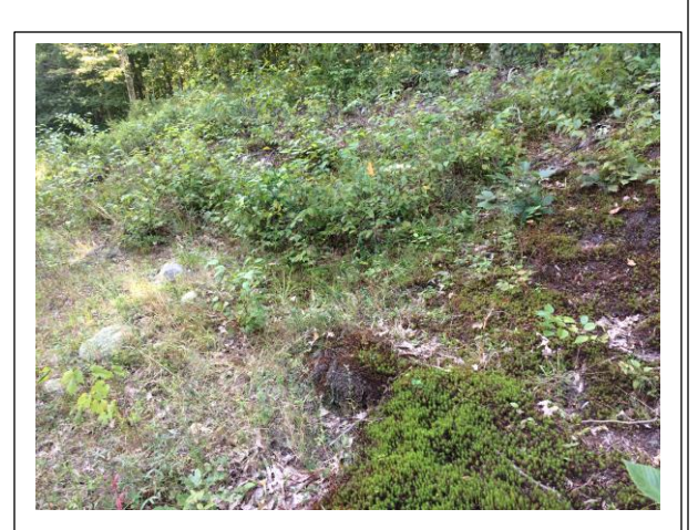
Figure 23. Subacidic Rocky Summit/Outcrop, Other/Unique sub-type, in the power transmission ROW. This expression occurs higher on the northfacing slope, where there is more shading by adjacent forest, and Haircap moss is a dominant ground cover.

Much more extensive than the Cedar woodland Sub-type of Subacidic Rocky Summit Outcrop at The Preserve is what I have designated as the Other/Unique sub-type of Subacidic Rocky Summit Outcrop, because it occurs entirely within the Eversource power transmission ROW, which is a special ecological space with unique management<sup>42</sup>. The Subacidic Rocky Summit Outcrop habitat in the ROW has many occurrences,