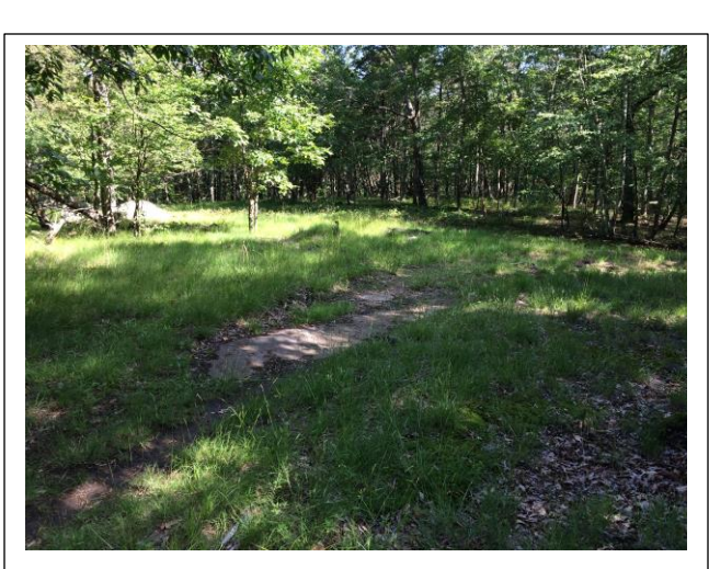
Figure 15. Acidic Rocky Summit Outcrop (Grassy Glade/Bald Sub-type) on a ridge summit outside the ROW.