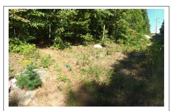
Figure 25. Subacidic Rocky Summit/Outcrop, Other/Unique sub-type, in the power transmission ROW. This expression occurs on a broadly convex ridge summit.

(4.7 acres) occurs low on the north slope of The Preserve, a landscape position at which Subacidic Rocky Summit Outcrop habitat is not typically found, and based on analysis of historic aerial photography, there appears to have deciduous and mixed evergreendeciduous forest in these areas before the ROW was installed. Except for some sites, soils appear to be deeper than is typical for the dry to xeric sites where Subacidic Rocky Summit Outcrop usually occurs, and the forests that occur on both sides of the ROW are mesic.