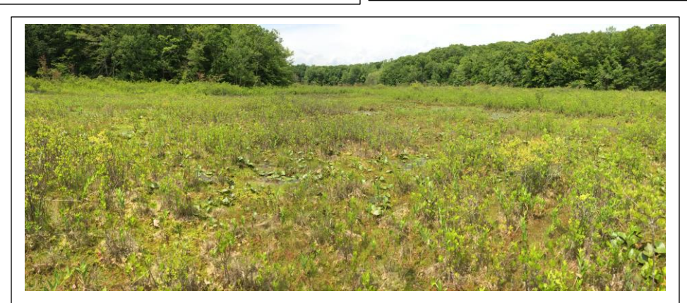
Figure 31. Medium Fen, Sedge Fen sub-type, in interior of Pequot Swamp Pond. Quaking Sphagnum mat is relatively level and very buoyant.

floating quaking may of Sphagnum moss with a saturated moisture regime, and lacking a well-developed woody subshrub or shrub strata (therefore called "bog meadow" in some literature). The Other/Unique subtype also occurs on a floating quaking substrate, but has well-developed hummock-and-hollow microtopography, with the hummocks and hollows supporting different micro-communities. I have called it Other/Unique because it has a well-developed subshrub layer (i.e., shrubs well under 1 m in height) dominated by Sweet Pepperbush ( Clethra alnifolia ). This is a type of fen that has not been previously described in Connecticut and I have been advised to