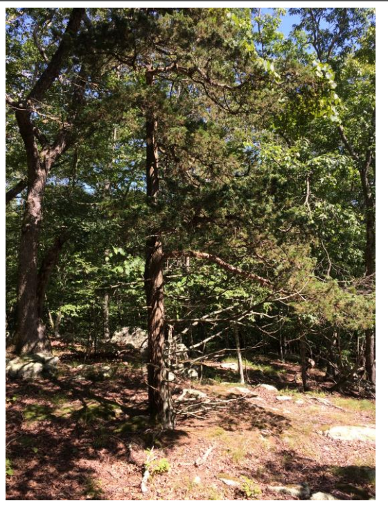
Figure 22. Subacidic Rocky Summit/Outcrop type, Cedar Woodland sub-type, on a convex summit.

At The Preserve, I have mapped as Subacidic Rocky Summit Outcrop - Cedar Woodland only those occurrences associated with hardwood tree canopy gaps of at least 12-15 m in diameter and larger. As explained in the previous section, this habitat also occurs as inclusions in Dry Subacidic Forest occurrences in canopy openings smaller than 12-15 m in diameter, at sites such as the rocky south-facing brow of a summit occupied by Dry Subacidic Forest. I have not mapped these smaller occurrences as separate from the Dry Acidic Forest. I have identified at The Preserve only 4 occurrences of Subacidic Rocky Summit Outcrop, CW that were large enough to map based on the above-mentioned size criteria, and those for cumulatively occupy only ~1.1 acre. As noted elsewhere in this report it is evident from historic aerial photos, the distribution of overtopped live and dead Eastern Redcedar and older wolf trees in Dry Subacidic Forest occurrences that the Subacidic Rocky Summit Outcrop, CW sub-type was once much more extensive at The Preserve.