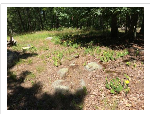
Figure 17. Small Acidic Rocky Summit Outcrop (Grassy Glade/Bald Sub-type) on a ridge summit outside the ROW.

soil pH, which appears most likely to be due to differences in bedrock chemistry. The soil pH in the Acidic Rocky Summit Outcrop is strongly acidic, while that of the Subacidic Rocky Summit Outcrop. This difference is reflected in significant differences in floristic composition, with the Subacidic Rocky Summit Outcrop supporting many plants with an affinity for higher pH, and the absence or lower abundance of the more acidophilic plants. The best marked occurrences of the two habitats occur at the ends of a