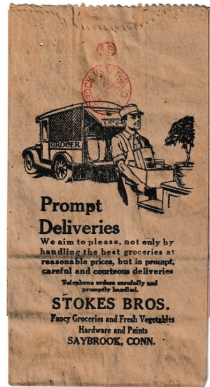
An original Stokes Bros. Grocery Store shopping bag

For more information, please contact the Land Use Department at (860)395-3131 or Lwacker@oldsaybrookct.gov .